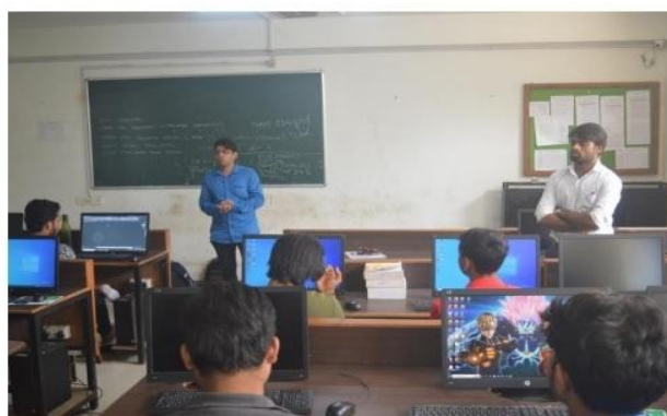
Course: AUTOCAD for Design and Drafting

College: Laxmi Institute of Technology, Sarigam