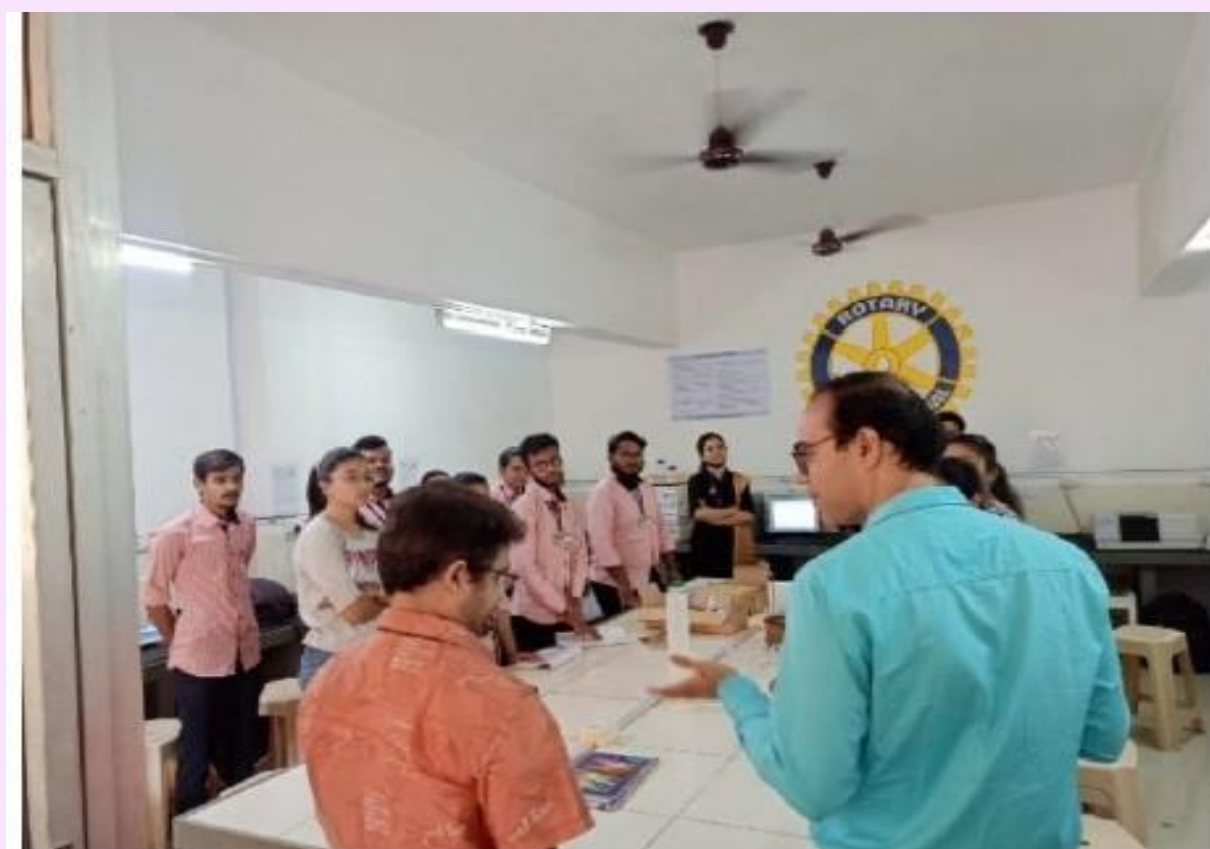
Course: Practical Hands-on High-Performance Liquid Chromatography College: Shree Naranjibhai Lalbhai Patel College of Pharmacy, Bardoli