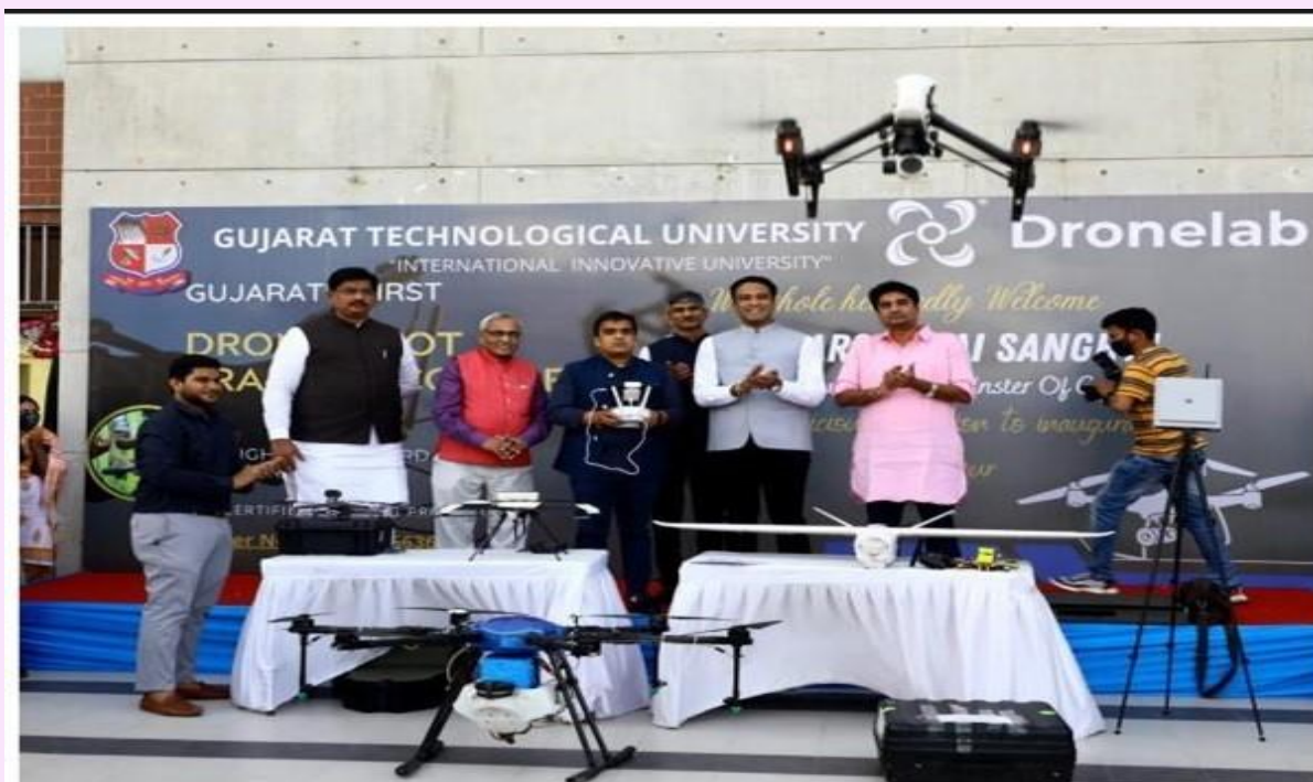
Drone Flying course jointly between GTU and Dronelab Technologies under GTU-CCE was inaugurated by Hon. Home Minister (State) Shri Harsh Sanghvi Ji on 24/2/2022