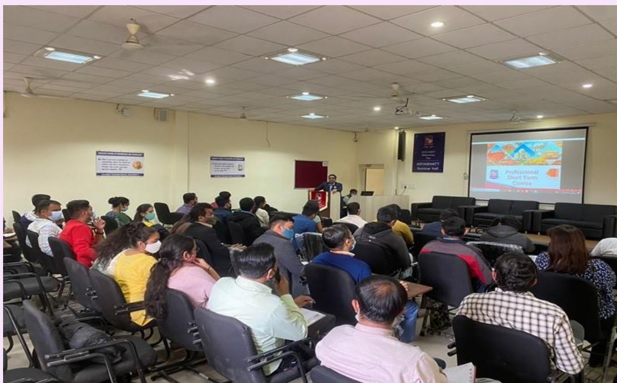
Course: Travel Consultant and Tourist Destination of Gujarat Sponsor: Tourism Corporation of Gujarat Limited