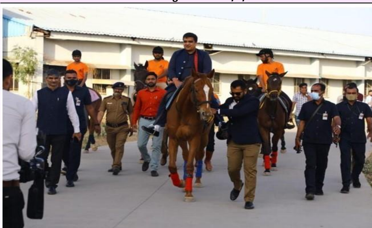
Horse Riding (Equestrian) course was inaugurated by Hon. Home Minister (State) Shri Harsh Sanghvi Ji on 24/2/2022